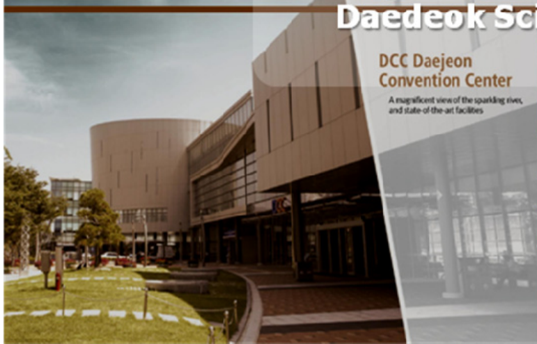
DCC Daejeon Convention Center

Daejeon Convention Center(DCC), Daedeok Science Town, Daejeon, Korea